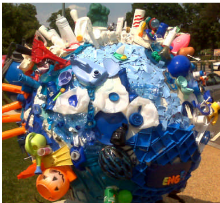
Figure 1. A Pop art sculpture outside the National Arboretum in Washington DC depicting the challenges which our current non-sustainable plastics present to the world.

This paper examines the current state of research into sustainable flame retardants with the work on nanocomposites highlighted. The motivations to move away from halogen-based flame retardants are discussed and a number of life-cycle-assessments are mentioned which set the stage for a similar LCA study of nanocomposite flame retardant products. Additives, such as hydrotalcite and cellulose nanofibrils, are proposed as components of potential future sustainable flame retardant nanocomposites.